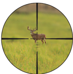
Reticle on Low Power

All Veracity riflescopes utilize a Front Focal Plane system. Front Focal Plane systems (also called First Focal Plane systems) place the reticle in front of the erector assembly or zoom mechanism. This allows the reticle to change size as magnification is adjusted. In FFP systems, when magnification is increased, the reticle size grows; as magnification is lowered, the reticle size shrinks. Because the reticle is changing with magnification, the measurements of the reticle are always correct and are proportional to the target, no matter what power setting you may be on. This also means that the trajectory compensation technology is correct in Veracity riflescopes at any magnification.