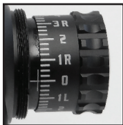
Proper Windage Zero

NOTE: Windage adjustments are made with a multi-direction adjustment knob. Zero is set with an indexing mark to allow for left and right adjustments. Failure to zero at the index mark may result in limited windage adjustment.