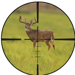
Reticle on High Power